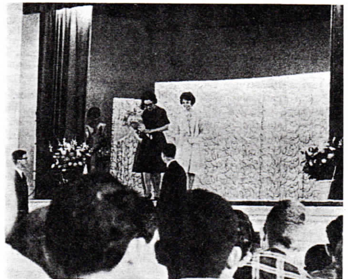
Third annual Yo-Hi Style Show